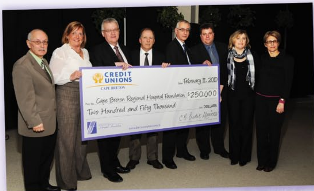
Cape Breton Credit Unions pledged $250,000 to the Cape Breton Cares Campaign