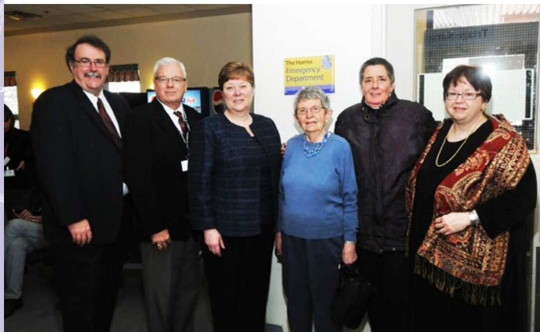
At a reception in January 2011, the Regional's Emergency Department was re-named the Harriss Emergency Department

In 2010, the Regional Hospital Foundation purchased an LED Phototherapy Unit for the NICU, which helps treat babies born with jaundice, and has provided support for the NICU Tender, Love and Care Fund. Also, as part of the $5.5 million Cape Breton Cares campaign, more than $600,000 was raised to purchase new monitors for the Neonatal Intensive Care Unit.